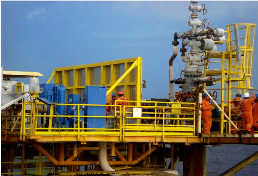
A DuraBlast Barrier protecting control panels.